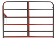
6ft. Gate Part#: TN6 Height: 48" Weight: 37 lbs Vertical Spacers: 1