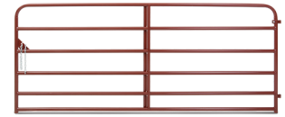
10ft. Gate Part#: TN10 Height: 48" Weight: 55 lbs Vertical Spacers: 1